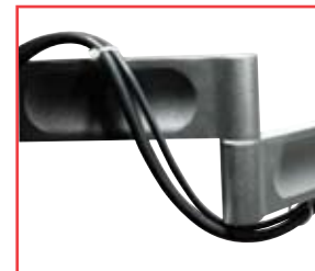
Cable management provides a clean look