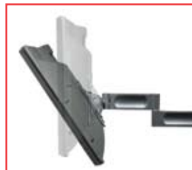
+/-35° tilt for optimal screen viewing angles